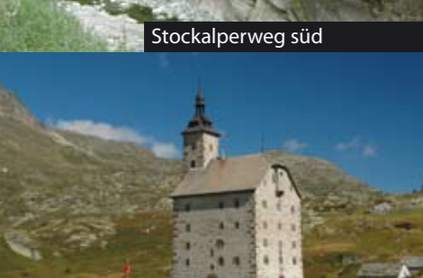
Simplonpass altes Hospiz