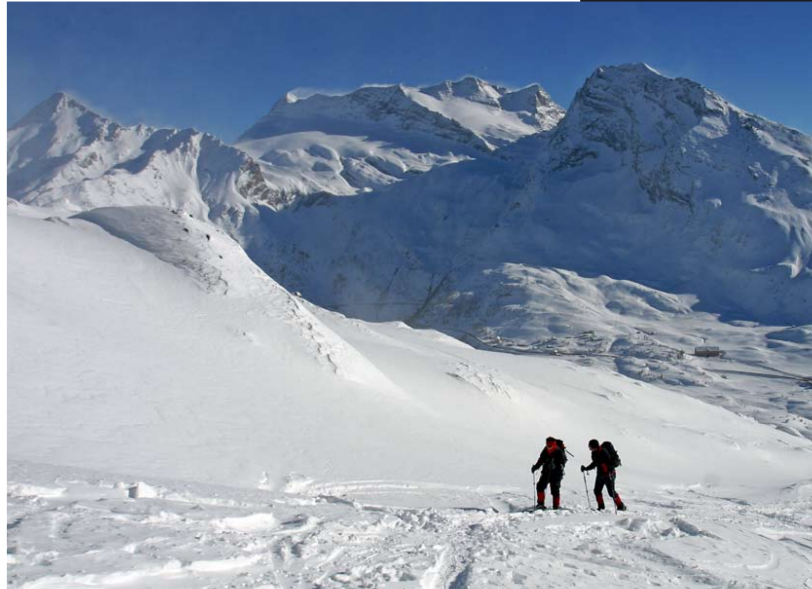
Schneeschuhlaufen oberhalb Simplonpass