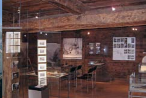
Ecomuseum Simplon Dorf