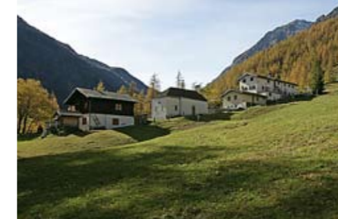
Bord / Zwischbergental