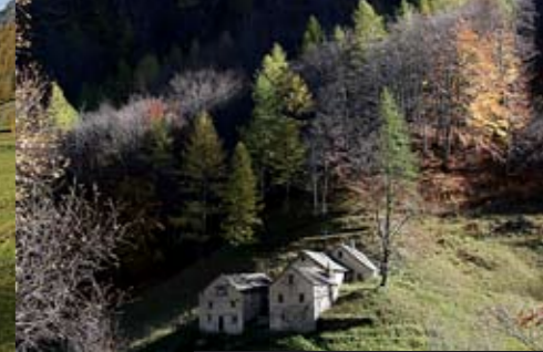
Rosi / Zwischbergental