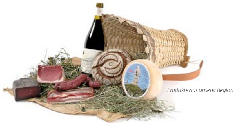
Produkte aus unserer Region

A restaurant for every day that is not what you would call an everyday restaurant.